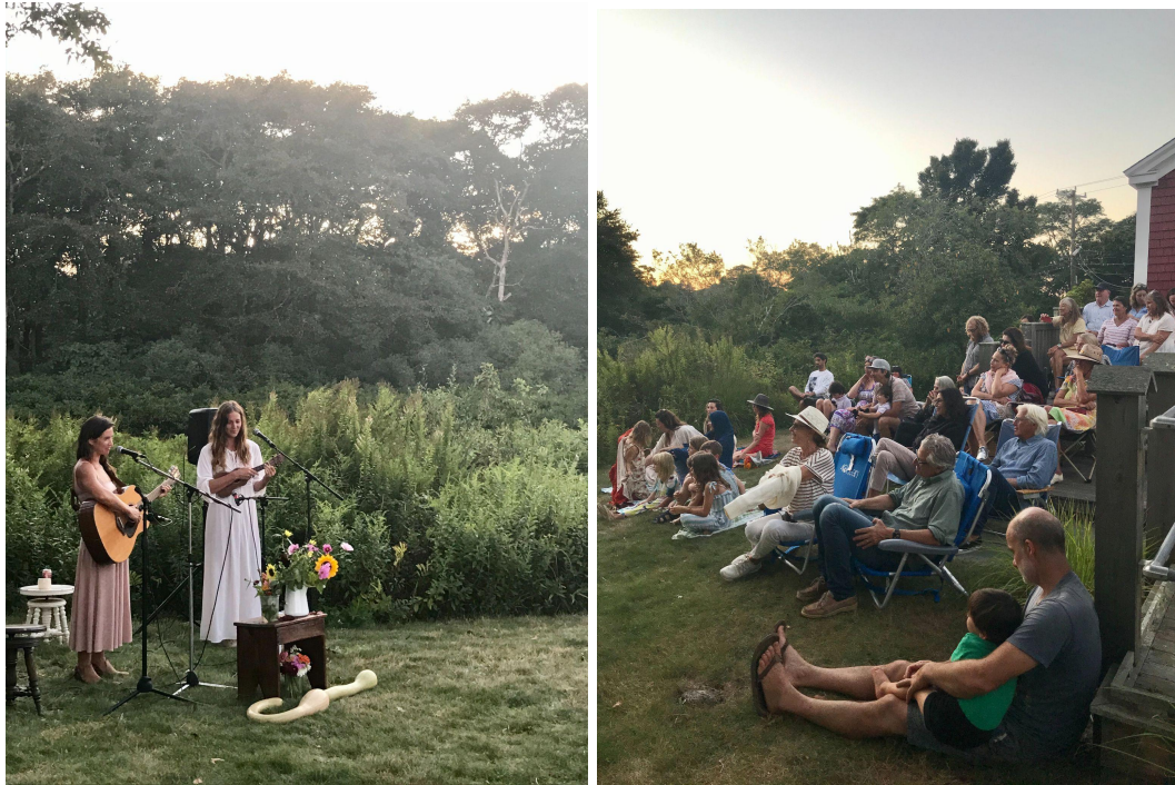
Setsunai performing on the library lawn to a full crowd. August, 2022.